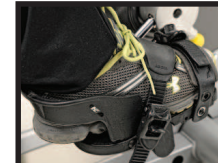
Low Support Boots