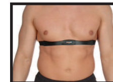
Heart Rate Chest Strap