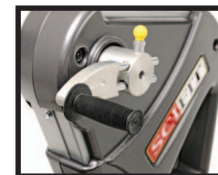
Straight Hand Grips