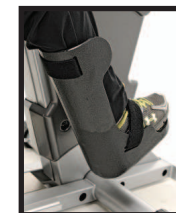
High Support Boots